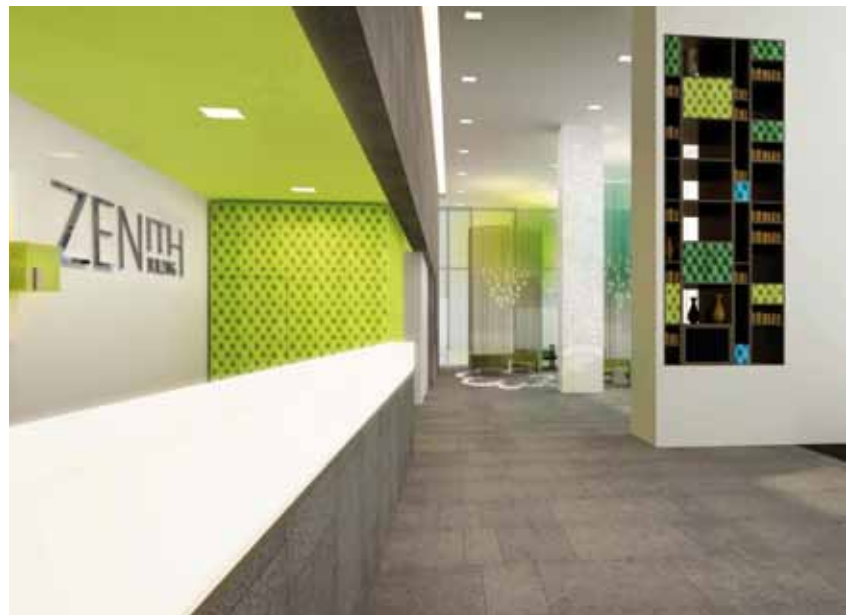
Visualisation of the entrance hall